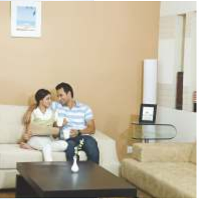
This is a conceptual image only.

An excellent combination of distance and connectivity... travel to any part of the city is a breeze !!