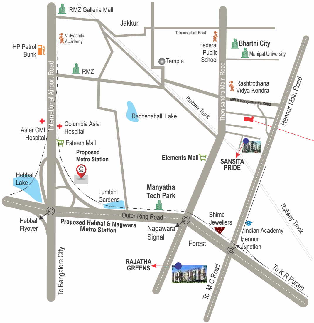
All the above distances are taken from Google maps.